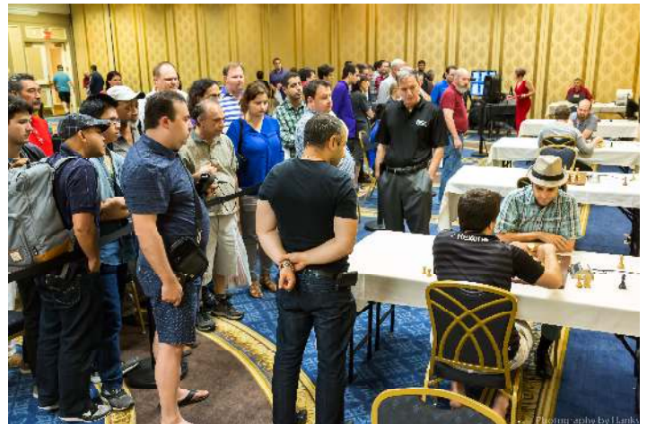
Kibitzers enjoy the "Spirit of Chess" GM blitz invitational