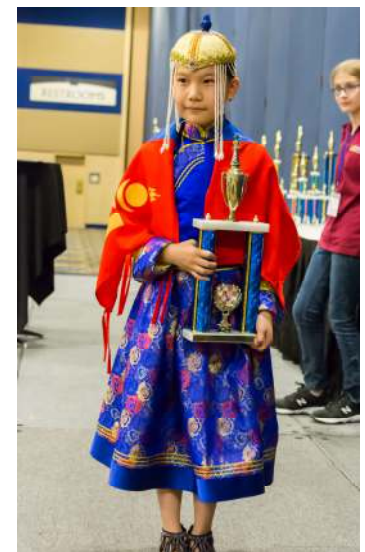
Below: a prizewinner from the International Youth Championships