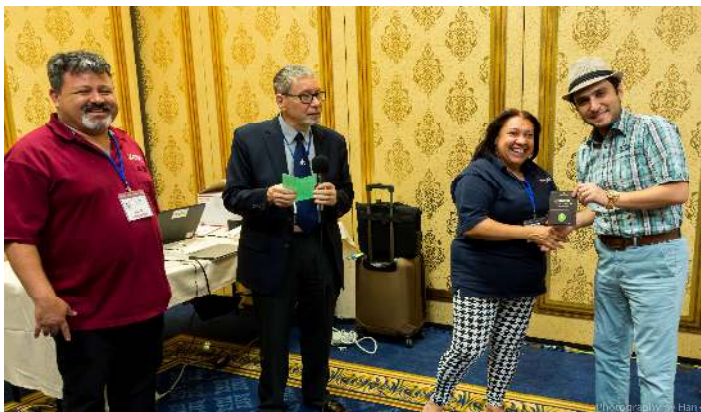
The sponsors of Sunday night's "Spirit of Chess" round robin blitz, the Las Vegas Chess Center, presented a gift to each GM