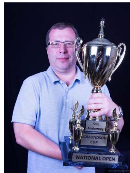
Defending National Open Champion GM Alexey Dreev

27.fxg5 Rxc6 28.Rxc6 Qxe5 29.Rcxf6+ Kg7 30.Rxa6 Qe3+