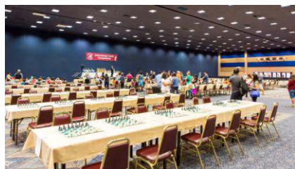
International Youth Championship

Here are the standings of the US Women's Open after day one: