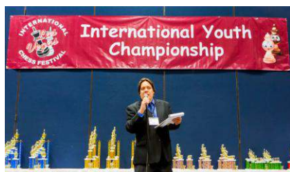
International Youth Championship