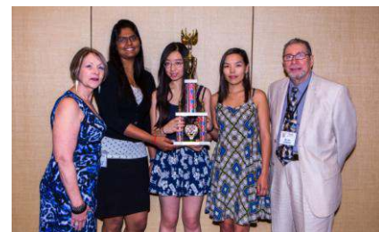
US Women's Champions